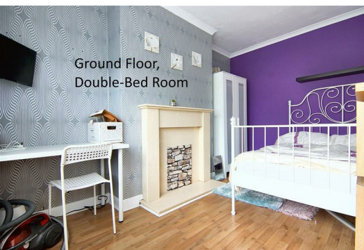
Ground Floor, Double-Bed Room